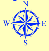
Figure 1 City of Umatilla Community Redevelopment Area Original & Expanded Boundary