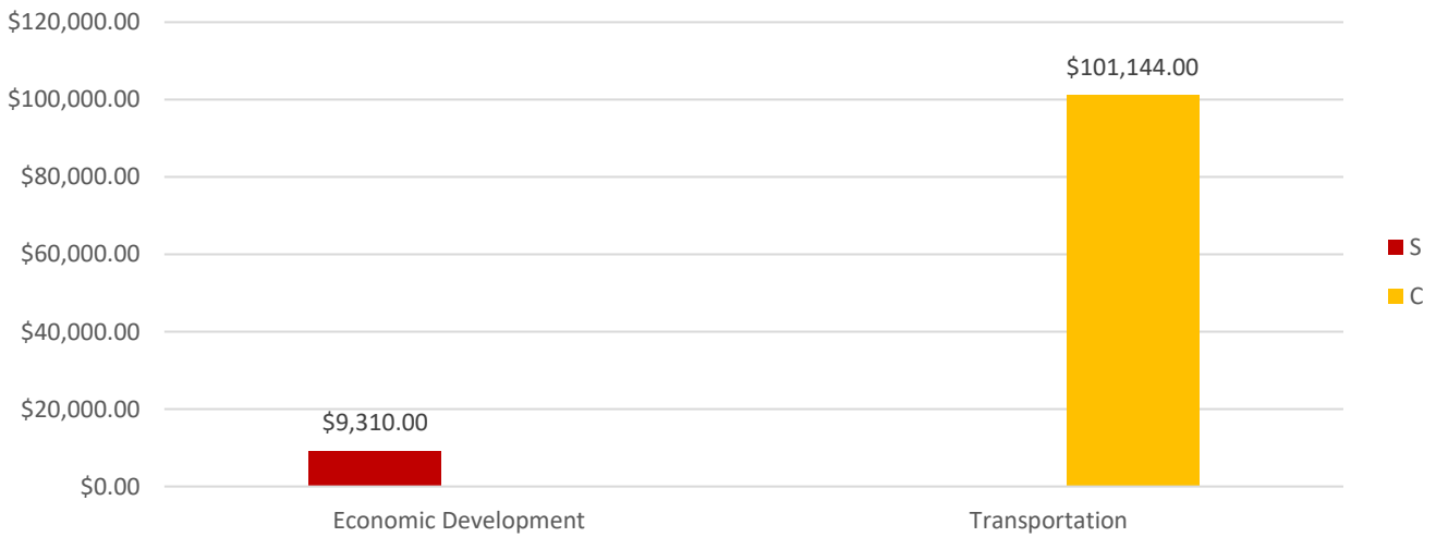
ACTIVITIES SUMMARY ($)